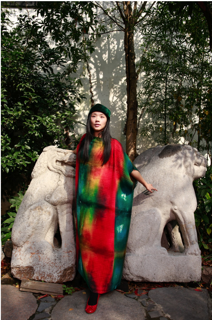
Dress for JinZe Girl Dupont colors on heavy silk, shibori

Out of the old textile factory surroundings rise like Phoenix from the ashes the multicolored bright JinZe Girls ready for new challenges of life.