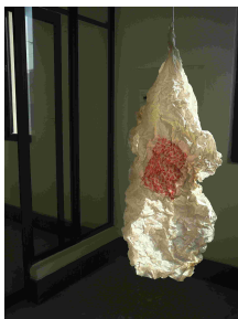
Fingerprints Red seal-ink on paper