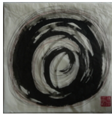
Ink paintings 70x70cm each, ink on paper