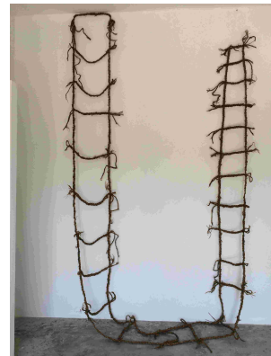
Purpose of Life 1100x 40x 80cm, recycled rice-straw, braided