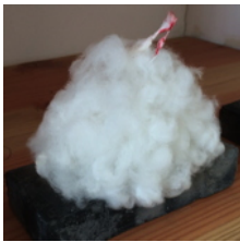
20 Pyramids, 20x 20x 7cm each, cotton, ink, old brick

Currently she displays two installations in the China National Silk Museum, Hangzhou and her Rooibos Teabag-Dress will be shown in December at the Fashion Gallery of Hong Kong Polytechnic University.